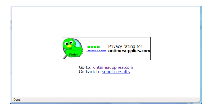
Figure 4. Screenshot of a website in the interstitial condition.

periment, we handed them instruction sheets that labeled the various features of Privacy Finder: the search box, the list of results, the annotated price information, the product pictures, and the privacy indicators. All references to "Privacy Finder" were changed to "Finder" in order to reduce priming effects. Likewise, we scheduled all participants at least 72 hours after taking our privacy concerns screening survey.