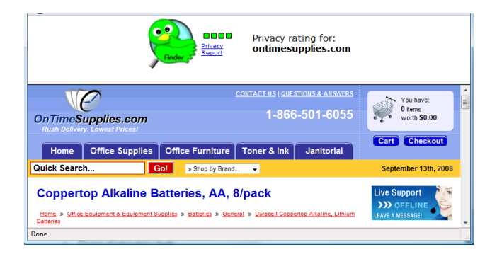
Figure 3. Screenshot of a website in the frame condition.